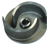
Impeller made of stainless steel